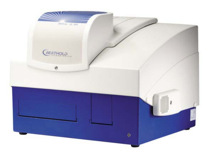
Figure 2: Mithras LB 940 multimode reader

The DiscoveRx AKT1 (Total) ELISA is designed to detect and quantify the levels of AKT1 protein, independent of its phosphorylation state. Although performance characterization of this ELISA kit was done primarily on human cell lines, cross-reactivity of this kit with mouse and rat cells was observed. This assay is intended to detect AKT1 from lysates of cells and can be used to normalize the AKT1 content of the samples when examining quantities of phosphorylated sites on AKT1 using other DiscoveRx kits.