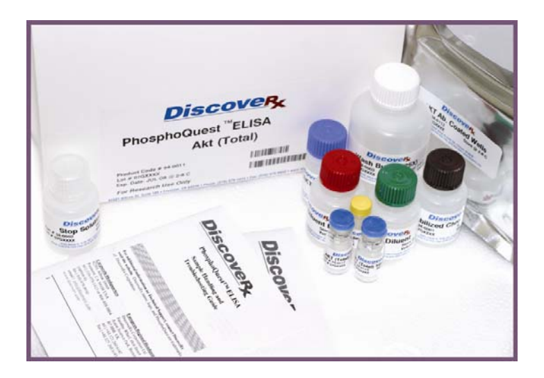
Figure 1: PhosphoQuest<sup>™</sup> kit contents

Kinases are most routinely assayed by using purified kinases, but many applications demand the ability to examine the kinase activity within a biological system. AKT, also known as the protein kinase B-a (PKB-a) or RAC-PKa, was initially identified as one of the downstream targets of PI-3 Kinase (PI3-K). Activated PI3-K generates 3' phosphoinositide products, 3,4,5-triphosphates (PI-3,4,5-P3) and PI-3,4-P2. AKT is recruited from the cytosol to the plasma membrane through the interaction of its PH domain with these phosphoinositides. Upon membrane localization, AKT undergoes a conformational change, which makes it accessible to phosphorylation at threonine-308 and serine-473 in the kinase domain by PDK-1 and related kinases.